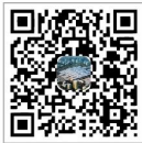
扫描二维码关注公众号

广州南站地区管理委员会（石壁街道办事处） 地址：广州市番禺区钟韦路73号212室 电话：(020)-39906660、(020)-39906685 邮政编号：511495